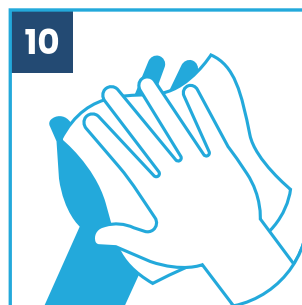
10 USE PAPER TOWEL