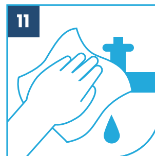
11 USE TOWEL TO TURN OFF FAUCET