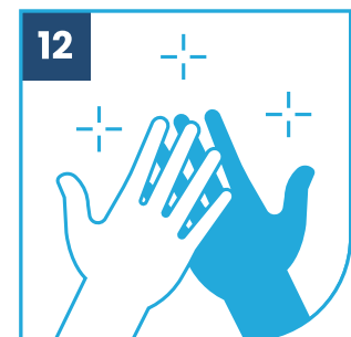
12 YOUR HANDS ARE SAFE

BE CAUTIOUS HELP PREVENT COVID-19 WASH YOUR HANDS PROPERLY