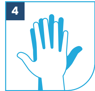
4 PALM OVER DORSUM