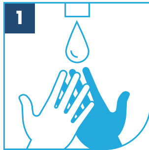
1 WET HANDS