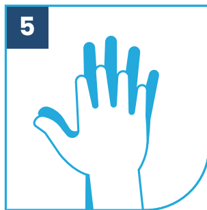
5 FINGERS INTERLACED