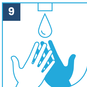
9 RINSE HANDS