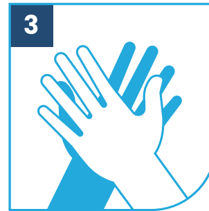
3 PALM TO PALM